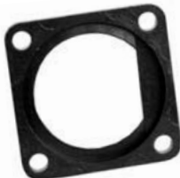
Square Flange Adapter 4296